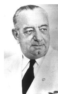
Henry Fillmore Richard Wagner