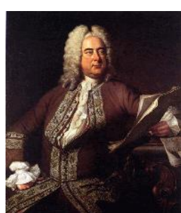
G.F. Handel J.P. Sousa