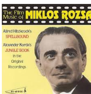
Miklos Rozsa Franz van Suppé