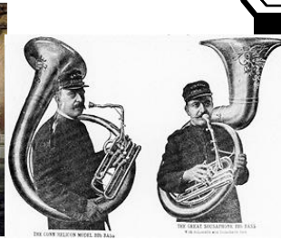
Helicon and "Raincatcher"

The sculptor Pygmalion falls madly in love with his statue of Galatea and implores Venus to bring her to life. Retaining "a heart of stone" where Pygmalion is concerned, she flirts instead with his servant Ganymede and the rich art collector Midas, so he has her turned back into stone, and sells the statue to Midas. Full of sweeping Viennese style waltzes, the operetta's North American premiere was 6 Sept. 1867