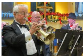
Flanges & Flugelhorns