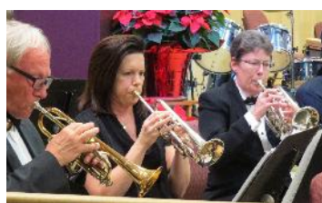
Leaky Valves Cornets