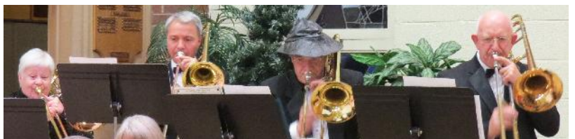
Slush Pumps Trombone Quartet – Newfoundland Folk Songs