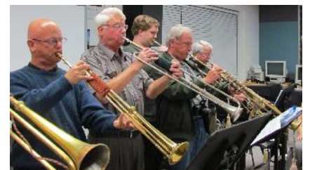
The King's Heralds Trumpeters