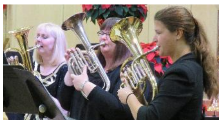
Siphon Sirens Alto Horns