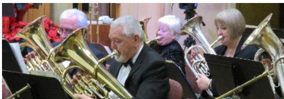
Tenor Tubas (Euphoniums & Baritones)

*Following the concert, please join the performers for refreshments & conversation!*