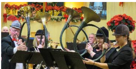
Parforce HornUtopia – Hunting Music