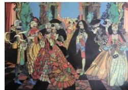
A Masked Ball - Verdi