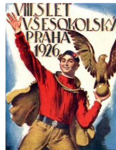
Sokol Gymnastic Festival, Prague, 1926