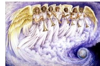
The Universal Judgment